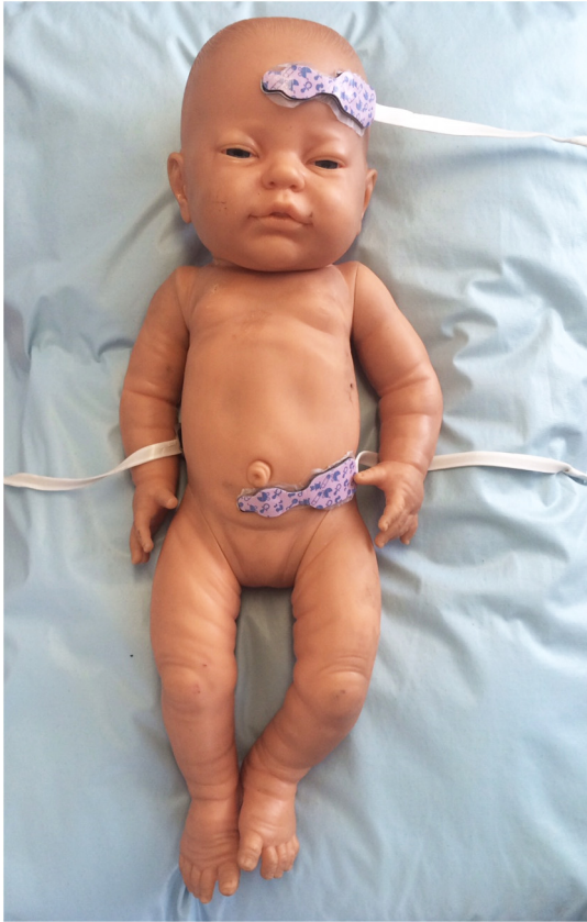
Fig. 3 Model of an infant patient depicting typical locations that NIRS sensors are placed in clinical practice.

NIRS sensor location. Focus thus far has been on the liver and the intestines. It has not been established which location is ideal to gather a sense of overall splanchnic circulation perfusion, but research and clinical usage is trending toward monitoring the gut. 56 Hepatic tissue may provide a steadier SrSO 2 signal due to its more uniform tissue consistency, but monitoring of the intestines may provide more clinical insight. 36 Either way, multiple organ site capability shows how splanchnic oximetry also has the ability to be somewhat particular, rather than generalized, when being used to diagnose organ specific disease processes, such as liver injury or necrotizing enterocolitis (NEC).