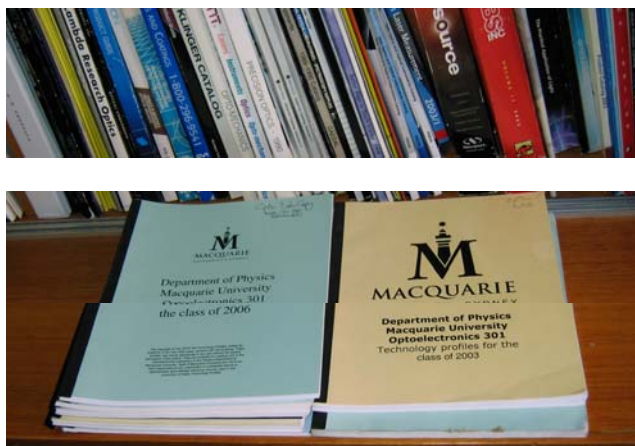
Fig. 1 Optoelectronics technology profile volumes as distributed to each student in the class. Profiles are copyright of the individual students and permission must be sought from the student for profiles to be distributed outside the class.

Student motivation is also addressed by “publishing” an annual volume of the technology profiles from the class as a whole and this has been a successful motivator for most students. Students are encouraged to produce an example of their work that they can show to potential employers. This student publishing was one of the features of teaching practice in the department that was selected for inclusion in the resource booklet from the project “learning outcomes and curriculum development in physics” produced as a national resource for tertiary physics teaching and learning in Australia 1 . Plagiarism is still an issue for a small number of students and some technology profiles are not “published” for this and other reasons. The importance of the dialogue between the “teacher” and each student as an individual, around the task, emerges as a key driver of deeper learning. Motivating students to complete the planning stages of the task in good time, so they may avoid making poor decisions on topic, and reference resource selection, with inadequate time to complete the task to the best of their abilities, remains a challenge. Student engagement, and therefore benefits, remains variable across the student population. A major benefit of the explicit and detailed nature of the task design is that it facilitates the teacher to have an evidence based discussion with individual students on how they could readily improve by planning and increased engagement.