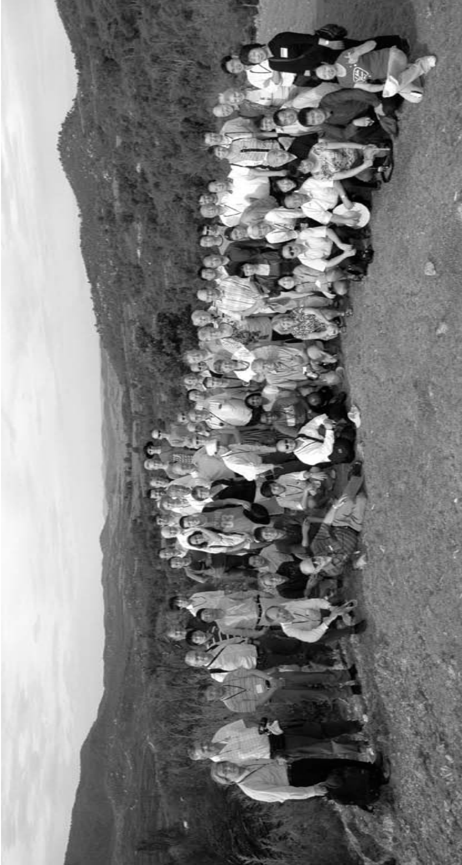
ICHSP28 Participants at Tidbinbilla Nature Reserve