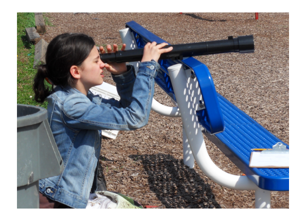
Figure 3. Connecticut student using her Galileoscope to make a field observation.