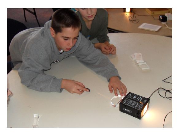
Figure 2. Students using ray boxes and geometric shapes to learn about refraction.

Before building the Galileoscopes, our students were introduced to refraction and lenses through an optics lesson provided by Judy Donnelly, professor of Lasers and Fiber Optic Technology at Three Rivers Community College (TRCC) and students from the SPIE student chapter at TRCC. Students used ray boxes (see Figure 2) to explore a variety of lenses and geometric shapes to understand refraction. By using this lesson, we were able to incorporate many of the GLEs, including (refer to Table 1) 5.1.2; 5.4.1; 5.4.2; and 5.4.4. By looking at each component of the lens assembly individually, the students developed a better understanding of how a refracting telescope works.