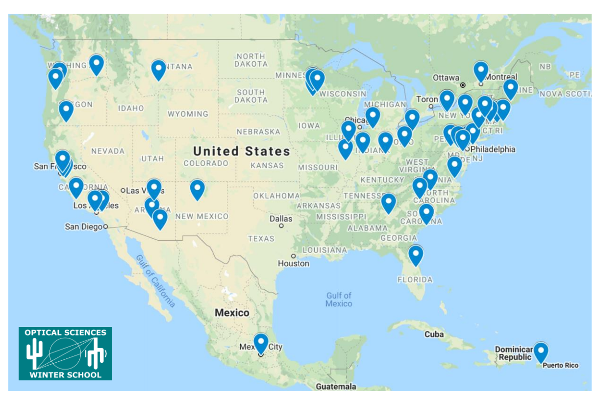
Figure 5. The accumulated Optical Sciences Winter School outreach map marking the participated schools as of January 2020 just before the major COVID-19 pandemic storm hits the world and limits all in-person activities. The OSWS committee had to plan a digital OSWS for the 6th Optical Sciences Winter School event in 2021.

The Optical Sciences Winter School has been continuously growing since its first successful event in January in 2016. Until the 2020 OSWS event, the OSWS have reached out to various schools and programs across the United Stated as marked in Figure 5 and the OSWS committee was planning to reach out to even more optics programs and schools.