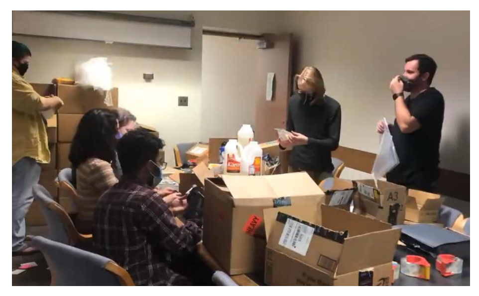
Figure 6. The 2021 OSWS student committee team prepared more than 50 boxes of Hands-On Experiment Kits for the digital Optical Sciences Winter School event during the COVID-19 pandemic in 2020 – 2021. (Time-lapse Video 1: http://dx.doi.org/doi.number.goes.here)

Thanks to the Hands-On Experiment Kits the OSWS students were able to experience hands-on learning through virtual lectures. As one of the lecture sessions utilizing the Hands-On Experiment Kits, Prof. Euan McLeod provided each student with a kit containing various optical components that they could use to follow along with his lectures from the comfort of their own homes as shown in Figure 7. Through this unique approach, students were able to gain practical experience in optics and photonics, without the need for in-person laboratory sessions. The virtual hands-on lectures were a resounding success, providing students with a rich learning experience that was engaging, interactive, and effective. By overcoming the challenges posed by the pandemic, the Optical Sciences Winter School team and partners demonstrated their commitment to providing high-quality education and training in optics and photonics, no matter the circumstances.