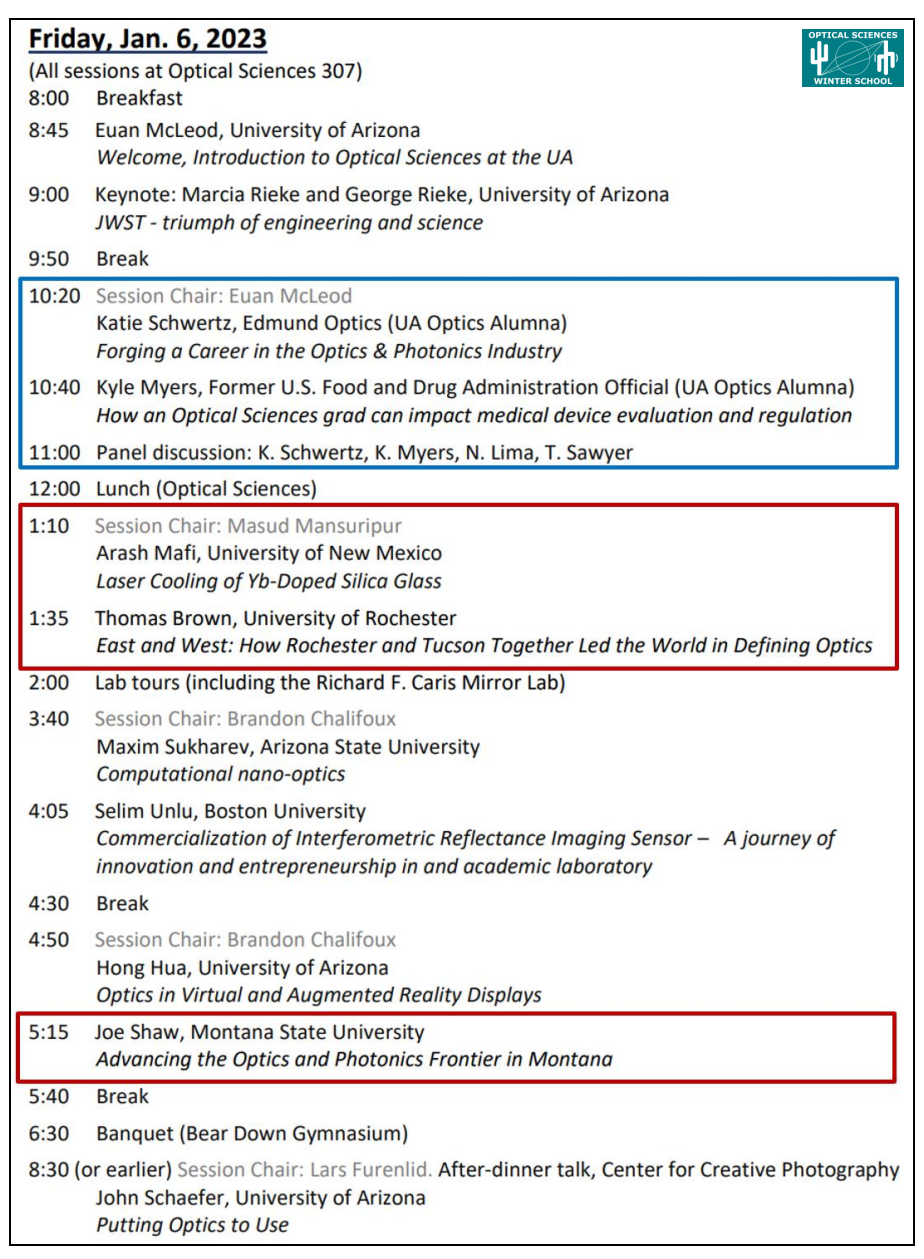
Figure 2. The third day program (out of the total four-days long program) includes the introduction of various excellent graduate optics programs in US (red boxes) and the panel discussion with the former graduates for career path questions and answers (blue box) during the 8th Optical Sciences Winter School in 2023.

During the following two days of 2023 OSWS (Note: This can be changed depending on the total days of the OSWS program accommodating the number of students, participating schools, and the year's academic calendar.), for students interested in pursuing a graduate degree in optics, there are sessions introducing and promoting diverse optics and photonics programs available across the United States. These programs (shown in the red boxes in Figure 2 and 3) offer a wide range of opportunities for students to explore the field of optics and photonics, from fundamental research to practical applications in areas such as physical/quantum optics, optical communications, bio-medical optics, lasers, imaging science, and optical engineering.