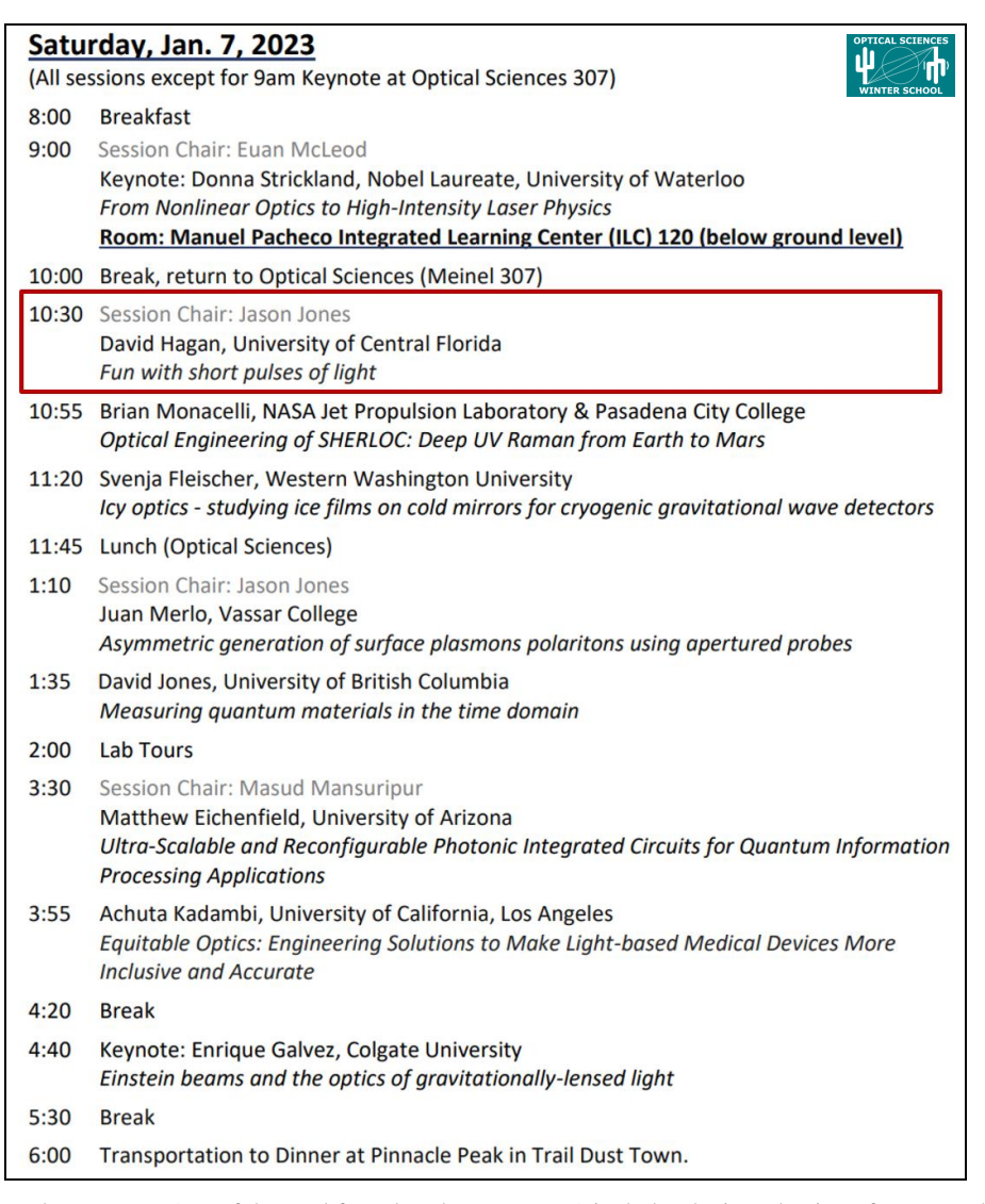
Figure 3. The last day program (out of the total four-days long program) includes the introduction of more graduate optics program in US (red box), lab tours, and the final day dinner gathering during the 8th Optical Sciences Winter School in 2023.

Also, the Optical Sciences Winter School offers a unique opportunity for students to engage with successful former graduates from the optics and photonics programs in the US. During the Winter School's panel discussion (e.g., blue box in Figure 2), attendees will have the chance to ask questions and learn about different career paths in the field of optics and photonics. The panel will feature graduates who have gone on to exemplary careers in academia, industry, and/or government, sharing their experiences and insights on what it takes to succeed in each of these areas. Participants will have the opportunity to hear about the realistic challenges and rewards of pursuing a career in optics, as well as tips for navigating the job market and finding the right fit for their skills and interests. The panel discussion provides an invaluable opportunity to gain practical advice and guidance from those who have walked the same path.