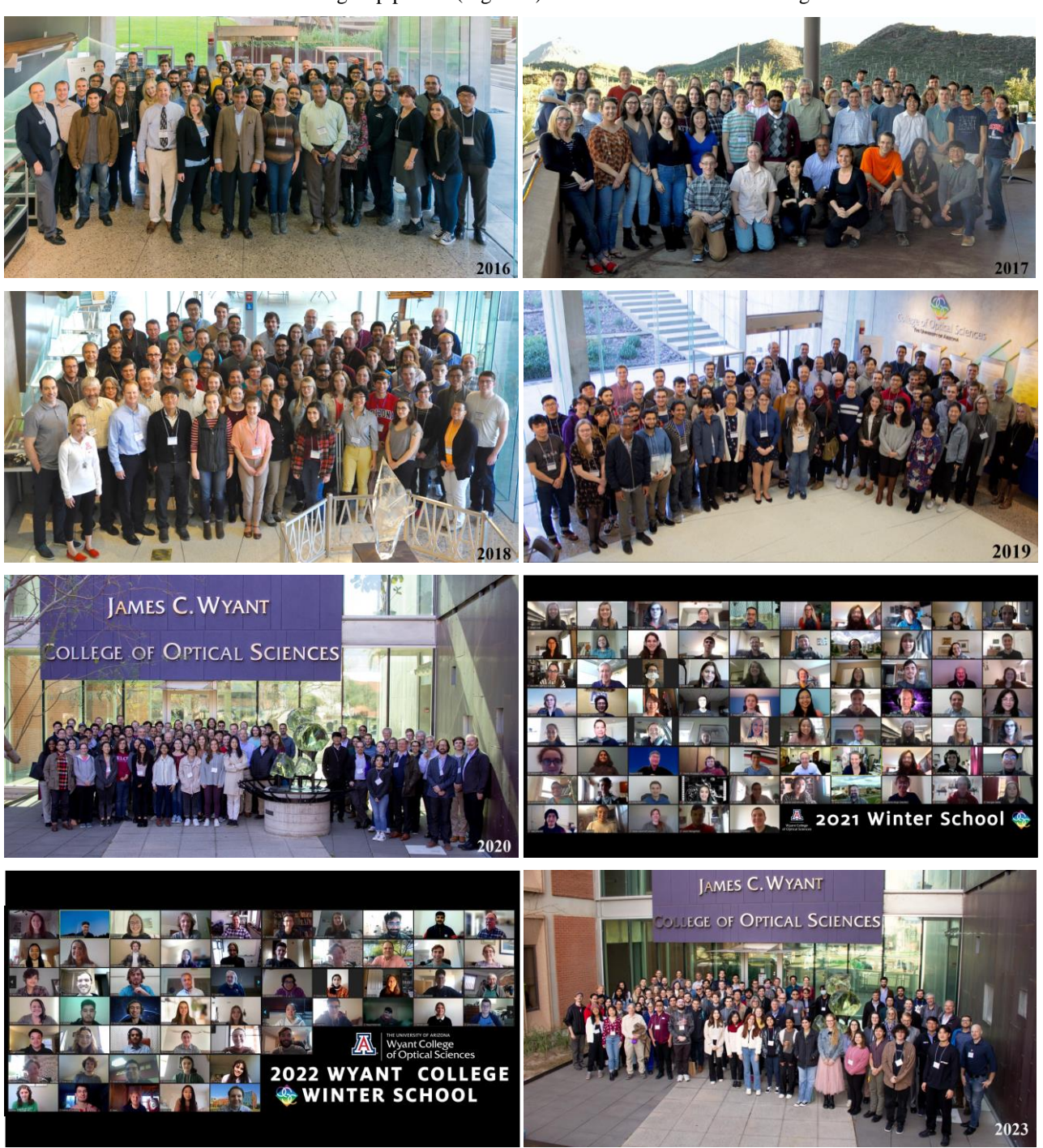
Figure 4. The Optical Sciences Winter School group photos from the first 2016 event (top left) to the 8th event in 2023 (bottom right). The virtual group photos for the two digital OSWS events during the COVID-19 pandemic in 2021 and 2022 are shown in the third and fourth rows.

Since the first Optical Sciences Winter School in 2016, the annual OSWS event has been a continuous success and achievement as shown in the series of group photos (Figure 4) of the educational outreaching event.