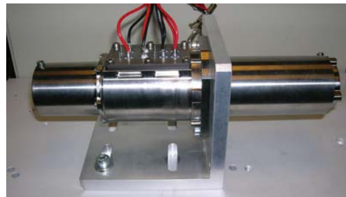
Fig. 1 Picture of the development prototype

The laser runs in the nanosecond regime, at a repetition rate of 10Hz maximum. Its architecture is based on an oscillator followed by two slab amplifiers. The oscillator is designed to provide a high beam quality. The output energy is enhanced in the amplifiers while keeping good spatial beam characteristics.